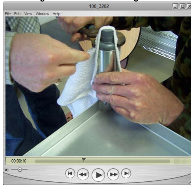
Figure 1: Remove Leveling Insert